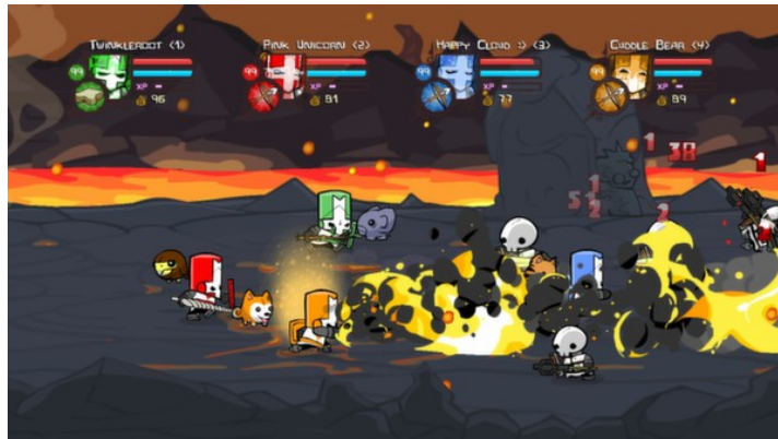
Figure 2: Castle Crashers, Screenshot (The Behemoth 2012)

We already created a function strong_attack_damage(level, strength) which calculates the damage of a knight using a strong attack.